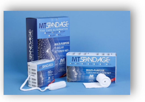
MT Spandage is Latex-Free and Made in the USA!